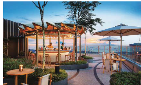
The musical ambience on the 39th-level bar Mr Stork is enhanced with Tannoy CVS 6 and DVS 4 speakers