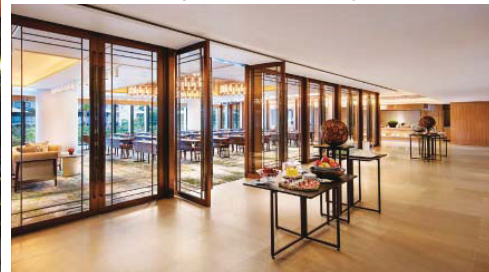
The Garden Studio function room provides a more intimate party experience

Singapore systems integrator, EAS, has brought the sights and sounds of the island nation into Hyatt's first Andaz in South East Asia. Richard Lawn reports