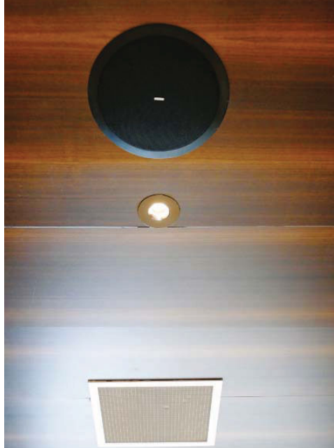
Andaz Singapore relies on Tannoy CVS 6 and CVS 8 ceiling speakers for its zoned BGM

Music is an important aspect of the hotel's public areas, especially on Alley on 25, with specific BGM playlists catering for different zones. As some of the restaurant outlets open 18 hours a day from breakfast until midnight, every day of