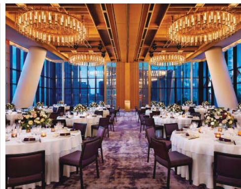
The divisible Glasshouse comes with challenging acoustics courtesy of the floor-to-ceiling windows

Before guests can familiarise themselves with one of the 342 rooms offering floor-to-ceiling windows for dramatic vistas of the city, they need to take two elevators via Alley on 3. Here, Andre Fu's signature becomes apparent as the intimate alleyways of the local shop houses have been woven into the third-level 'alleyway'. Circumnavigating this almost circular floor, Alley on 3 allows guests to dip in and out of various